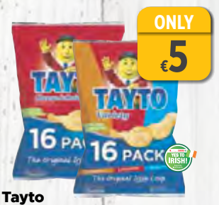
Cheese & Onion/Assorted Crisps 16 Pack 400g €12.50 per kg