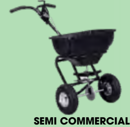
SEMI COMMERCIAL BROADCAST SPREADER €134.95