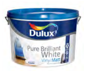
DULUX V MATT WHITE 11LTR ONLY €39.95