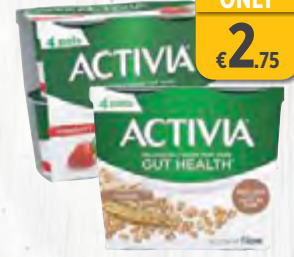
Danone Activia Yogurt Range 4 Pack See Shelf for Information