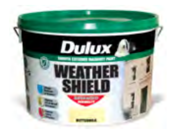
DULUX WEATHER SHIELD 10LTR COLOUR BUY 2 FOR €139