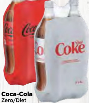
2x2lt 86c per lt