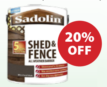
SADOLIN SHED & FENCE