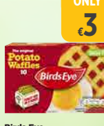
Birds Eye The Original Potato Waffles 10 Pack 567g €5.29 per kg