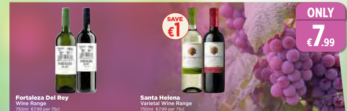
Fortaleza Del Rey Wine Range 750ml €7.99 per 75cl