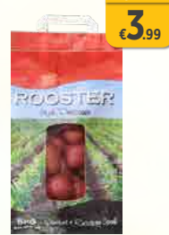
Irish Potatoes Washed Rooster 5kg 80c per kg