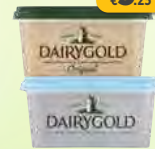
Dairygold Diet Fat Free Bio-Live Yogurt Berries 8 Pack 8x125g €3.50 per kg