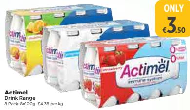
Actimel Drink Range 8 Pack 8x100g €4.38 per kg