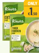
Knorr Packet Soup Range Various See Shelf for Information