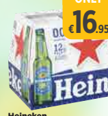
Heineken 0.0% Non Alcohol Lager 12 Pack 12x330ml €4.28 per lt

ONLY HALF PRICE €2.24 Regular Price €4.49 €5.50 per kg