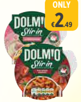
Dolmio Pasta Sauce Stir In Range 150g €16.60 per kg