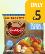
Birds Eye Chicken Dippers 403g €12.41 per kg