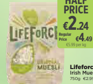
Lifeforce Irish Muesli 750g €2.99 per kg

ONLY €2.59 Regular Price €4.23 €4.23 per kg