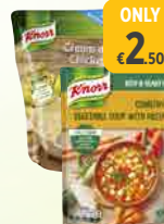
Knorr Rich & Hearty Soup Range 390g €6.41 per kg