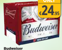
Budweiser Lager Bottles 20 Pack 20x500ml €4.16 per lt