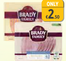
Brady Family Cooked Ham Range Pre Pack 60g €31.25 per kg