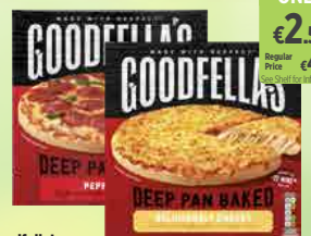
Goodfella's Deep Pan Pizza Range Various See Shelf for Information

ONLY €2.59 Regular Price €4.23 €4.23 per kg