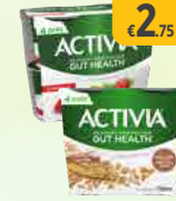
Danone Activia Yogurt Range 4 Pack See Shelf for Information