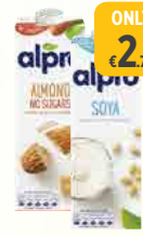
Alpro Dairy Alternative Range lit. €2.75 per lit