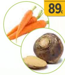
Fresh Choice Carrots Tray 400g €2.23 per kg Turnip Loose Unwrapped See Shelf for Information