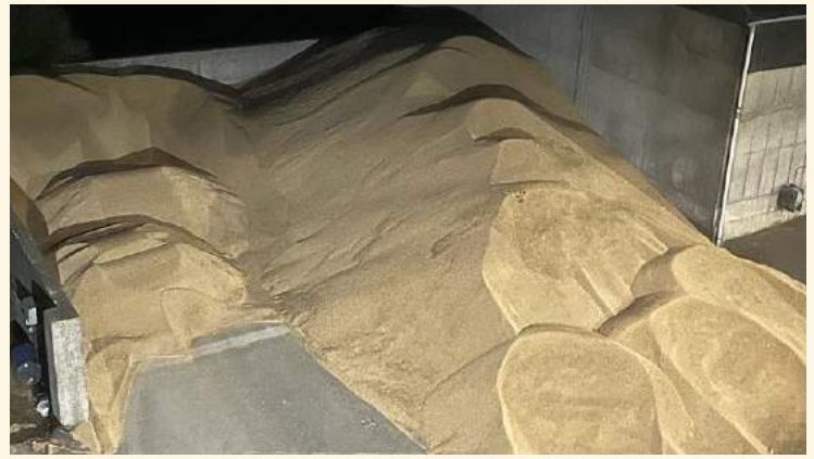
HARVEST 2023: Despite it being a demanding year for tillage farmers, the overall quality of grain received was excellent, and yields were good.