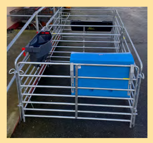
Buffalo 5Ft Calf Hurdles Buy 4 For €199