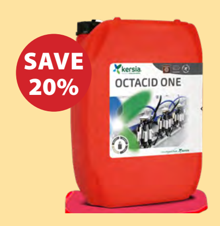
OCTACID ONE 22KG Was €119 Now €95