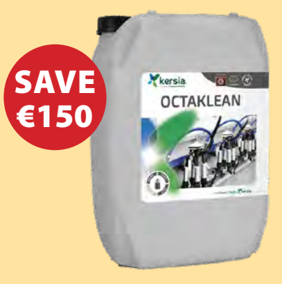
OCTAKLEAN 250KG Was €519 Now €369

One of the most modern & cost effective wash routine's available