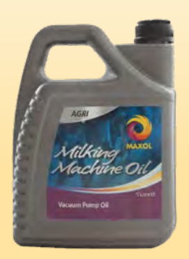
Maxol Milking Machine Oil 5 Ltr Buy 2 For €39.95