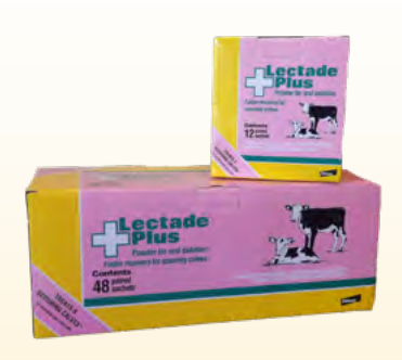
Lectade Box 48 ONLY €89