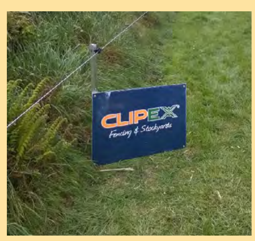
Clipex Eco 1.5Mtr 2 Clip Fence Posts Buy 10 For €89