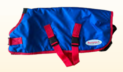
Barryroe Calf Jackets Buy 3 For €75