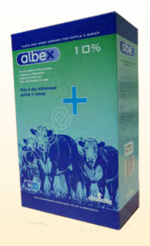
Albex 10% 5Ltr ONLY €79