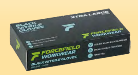
Forcefield Milking gloves Buy 2 For €25