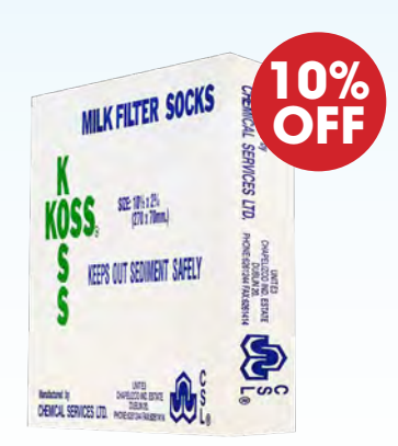
Milk Filter Socks