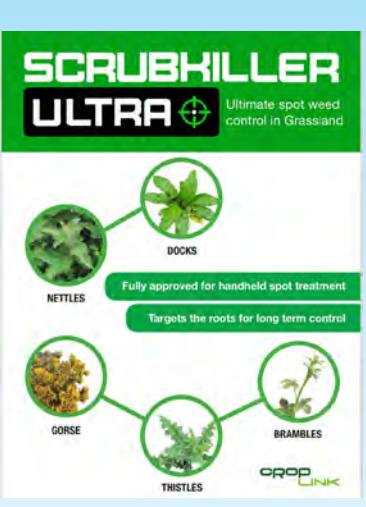
ScrubKiller Ultra 1Ltr ONLY €59