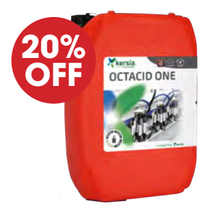
OCTACID ONE 22KG WAS €119 NOW €95

( ONE OF THE MOST MODERN & COST EFFECTIVE WASH ROUTINE'S AVAILABLE)