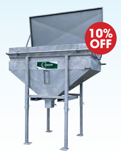
Condon 2Ton Meal Bin