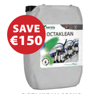
OCTAKLEAN 250KG WAS €519 NOW €369