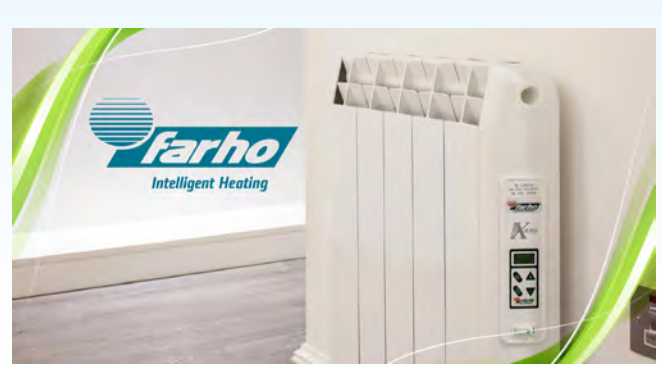
Faro Intelligent Heaters EXCELLENT OFFERS IN STORE