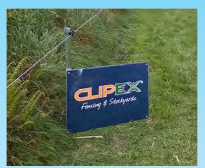
Clipex Eco 1.5Mtr 2 Clip Fence Posts BUY 10 FOR €89