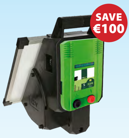
FARMSTOKK SOLAR FENCER S2300 WAS €499 NOW €399